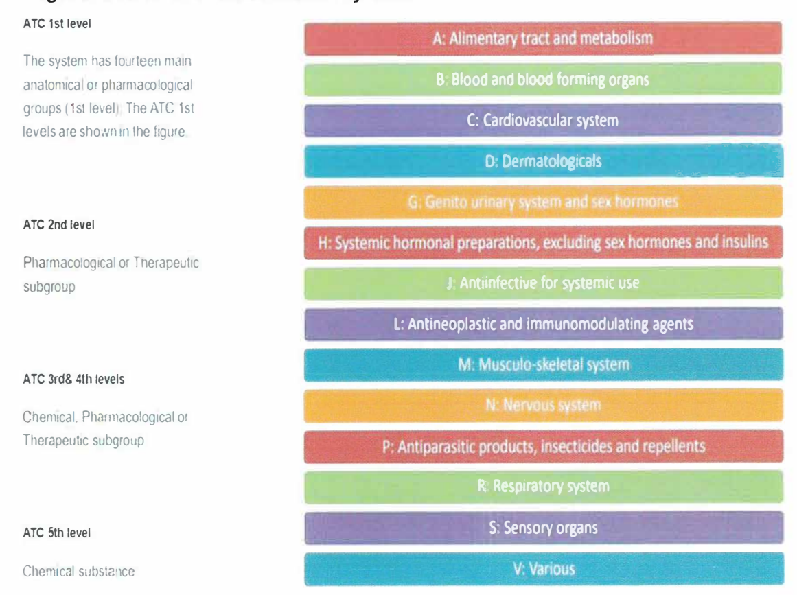
Figure 2: WHO ATC classification system